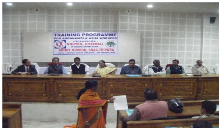
Awareness Camp with Anganwadi & Asha Workers by Abhoy Mission at Udaipur