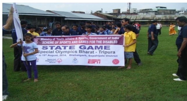
Various games & sports organized by Abhoy Mission & Special Olympics Bharat – Tripura Chapter