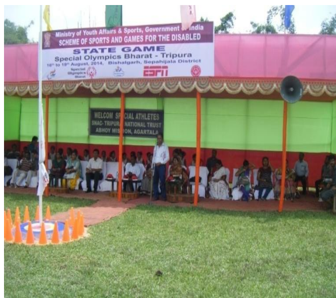
State Game of Special Olympic Bharat – Tripura Chapter at Bishalgar organized by Abhoy Mission