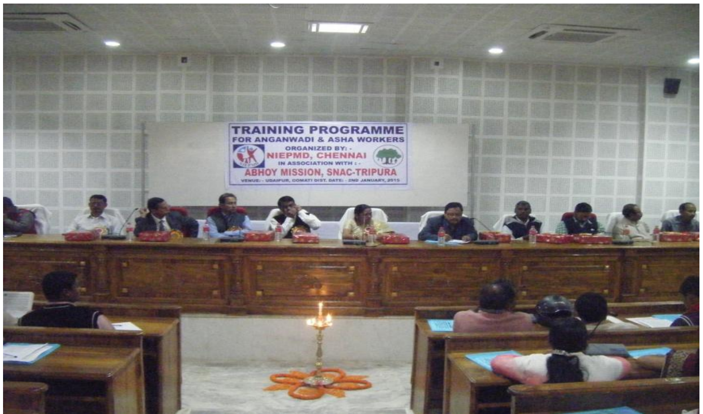
Training Program for Anganwadi Workers & ASHA Workers in collaboration with NIEPMD, Chennai.