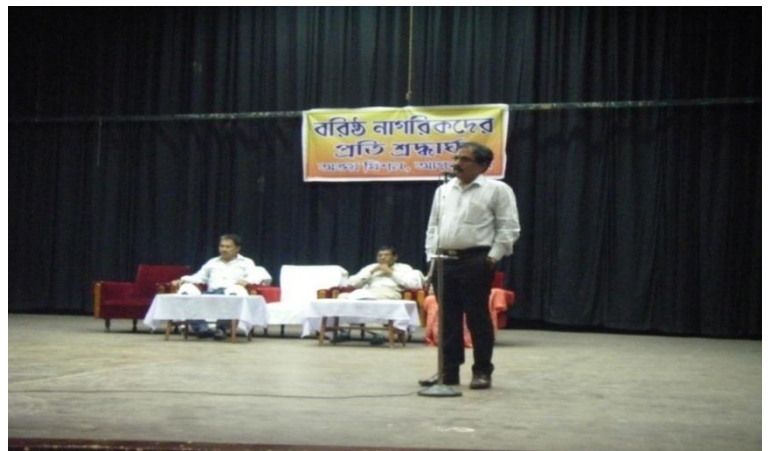
Sensitization programs for bridging the Inter-Generational Gap between Youths & Elderly